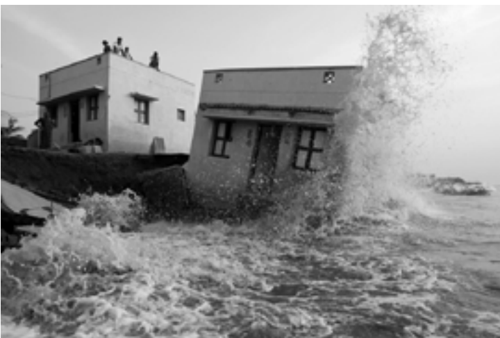
Selvaprakash Lakshman - Troubled Waters